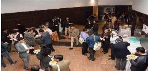
Networking and Interaction