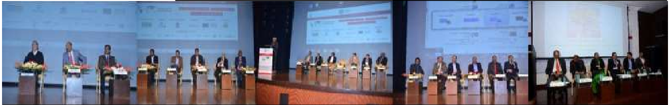
Important plenary sessions in 2017 Annual conference