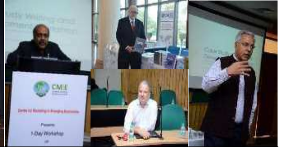
Case Study Writing and Development Workshop, Jan 2017