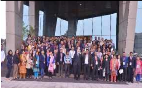
2017 Annual conference Group Photo