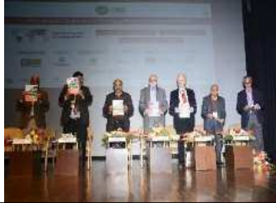
CMEE flashback 2011-16 release in 2017 Annual conference of EMCB